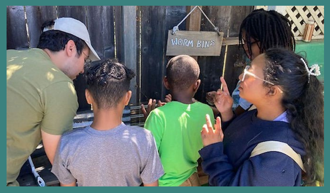
Students checking out the composting worms in the worm bin.