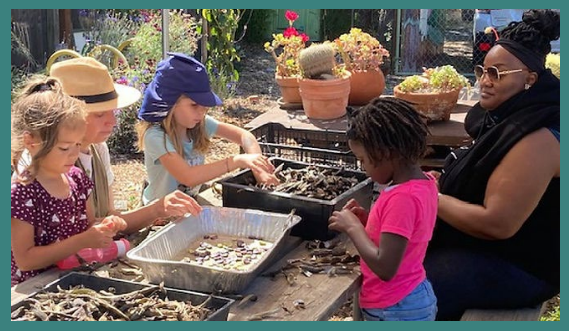
Students shelling fava bean pods.