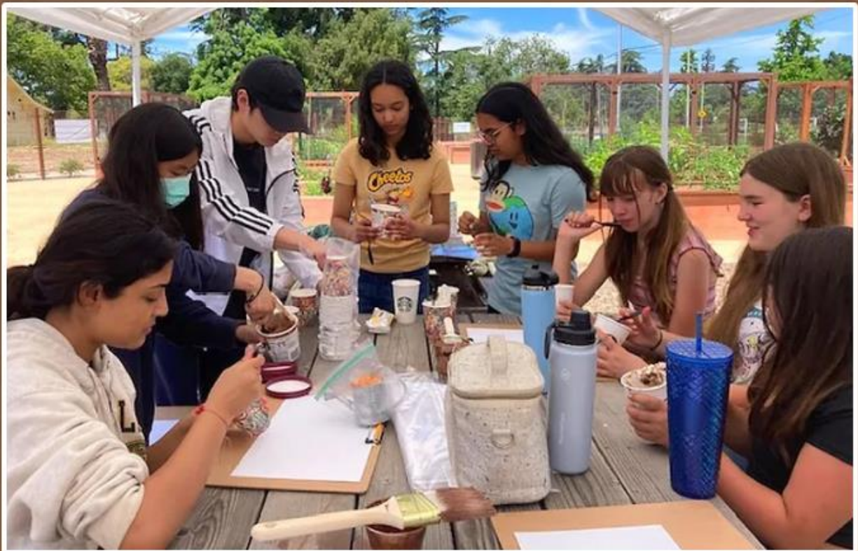
“The Leaflets” enjoying an ice cream break between learning exercises.

Our 2023 Students for LEAF Summer Program kicked off in June. The “Leaflets”, their new nickname, learned how to create basic landscape designs, clean garden beds, transplant seedlings, propagate seeds and cuttings, harvest veggies and herbs, seal redwood boards with paint, and much more! These will continue to work with us until they go back to school a little later this month.